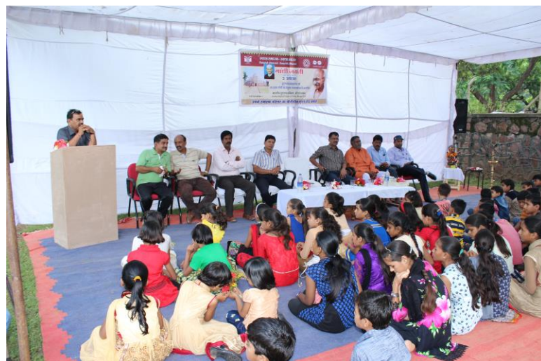
Chief Guest addressing to the audiences