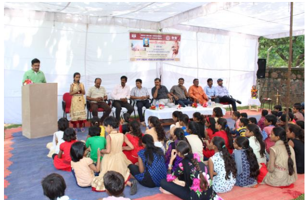
School Children sharing their taught & ideas on clean India campaign of Mahatma Gandhi and life of Lal Bahadur Shastri