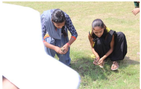
Swachhta Abhiyan at museum premises