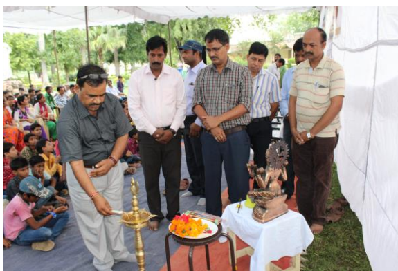
Chief Guest lighting the lamp