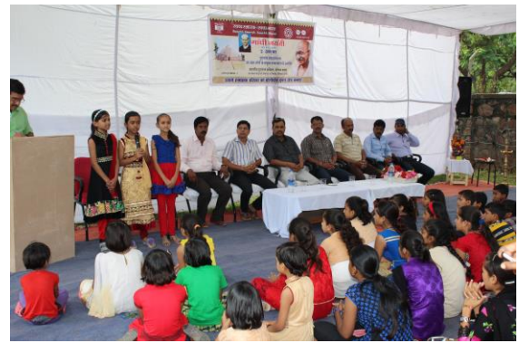
School children performing Saraswati Vandana