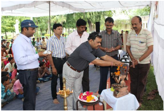
Chief Guest offering flowers to goddess Saraswati