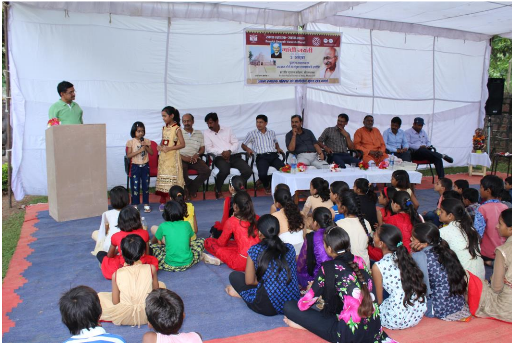
School girl reciting a poem on Mahatma Gandhi